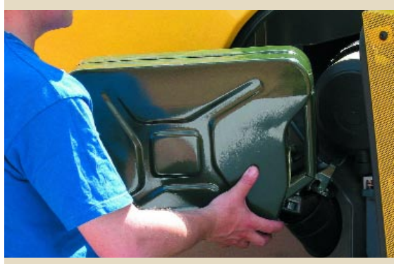
Easy fuel filling, even directly form a fuel can without spout of funnel.