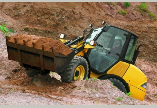
Outstanding maneuverability even in difficult situations.

State-of-the-art technology gives you the best possible output. A powerful Volvo engine at the core of the system supplies ample power. Smooth working cycles are assured due to the dual circuit hydraulic system with separate pumps for working and steering hydraulics. This ensures total independence of movements, which contributes to the smoothness of working cycles and rapid cycles times.