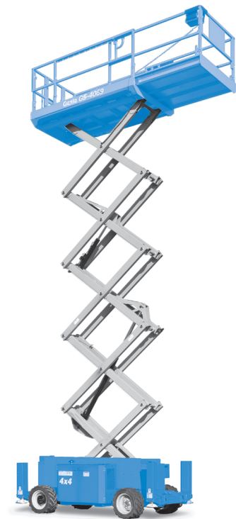
07/15 Part No. B127284UK